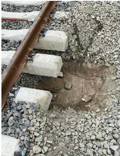
Plate 2. Inspection test on site

The change of water content is shown in Figure 2. During the period of monitoring, there were many obvious rains and the surface water content of the subgrade bed changed significantly, and the monitoring results showed that the volume water content changed by about 35%. The moisture content of the fine-grained soil subgrade has almost no immediate significant change. Only on the whole, it shows a moderate increase with the increase of the upper moisture content, and the change is about 5%. The result shows that the chemically-improved soil layer has a significant separation and anti-seepage performance, and can block the infiltration of a large amount of precipitation. For water-sensitive soil, the use of suitable chemically-improved soil protection can play a better role, but the use of chemically-improved