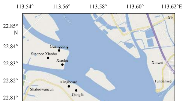
Fig. 1. Location of petrochemical wharfs in Xiaohu Port area, Guangzhou Port.

Xiaohu Port area in Nansha Port, Guangzhou has 5 adjacent petrochemical wharfs, i.e., Guangzhou Xiaohu Petrochemical, Sinopec Xiaohu, Guangdong Petrochemical, Gangfa Petrochemical and Kingboard Petrochemical, as shown in Fig. 1. The port is visited by over 3 000 ships per year and the annual throughput of oil and chemical is about 9 million tons. Adjacent to several environmental sensitive areas, the port has a high risk of ship-source oil spill accidents.